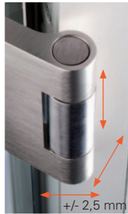
■ Adjustable in height, horizontal and gasket pressure +/- 2,5 mm