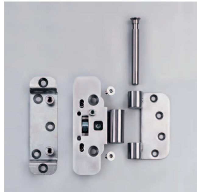
■ Support for cover frame